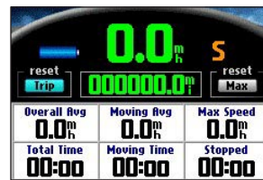
Trip Information Page